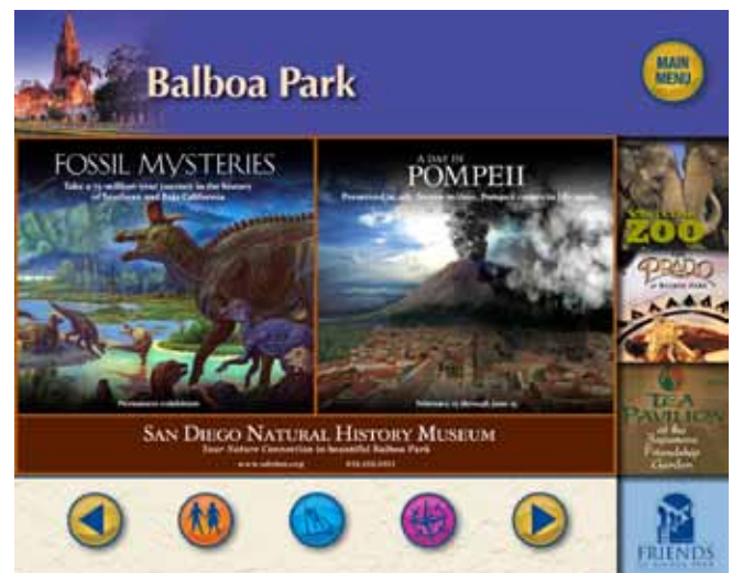
Ad screens are linked to an ad button with promotional information on your venue or offering.

We can accept your artwork digitally per our specifications or we can create custom artwork for you at a nominal charge.