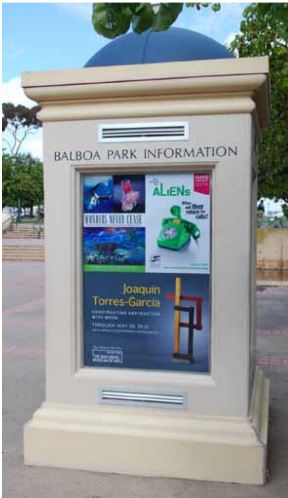
Kiosk showing external billboard advertising in quarter panel and half panel formats.

We can accept your artwork digitally per our specifications or we can create custom artwork for you at a nominal charge.